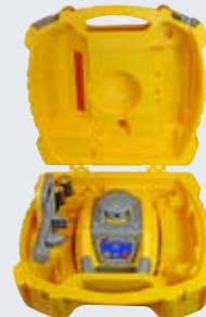
Standard case with laser and receiver only also available.

PHM Survey Equipment Lv1, 71 Victoria Road Rozelle 2039 NSW Tel: 02 9555 9175 Email: nic.adams@phmsurvey.com.au www.phmsurvey.com.au